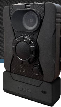
Swappable Secondary Battery