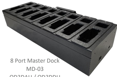
8 Port Master Dock MD-03 OD3DAU / OD3DDU

Warranty: 1 Year Standard limited warranty*. Extended plans available.