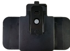
Chest Mount ORB33X