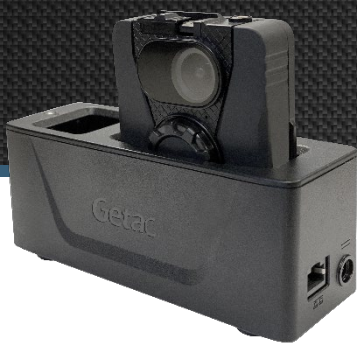
Single-Unit Charging Dock