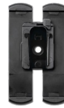
Molle Mount ORB34X