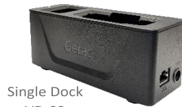
Single Dock VD-03 ORB27X