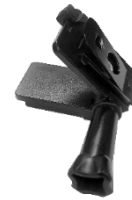
Swivel Mount ORB43X