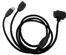
Magnetic Charging Cable ORB42X