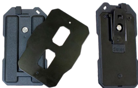
Magnetic Mount Single-ORB36X Dual-ORB41X