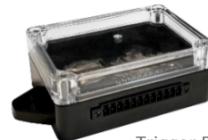
Trigger Box OTX11X